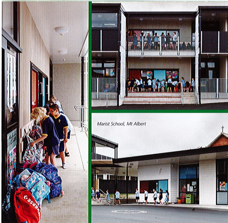
Marist School, Mt Albert

Attendance Dues are used to pay for building related costs at Catholic Schools in the Auckland Diocese.